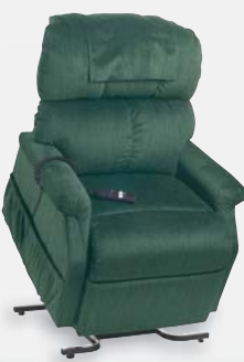
Comforter Large PR-501L