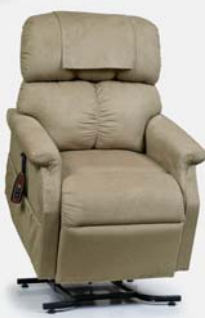
Comforter Small PR-501S