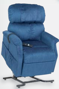
Comforter Junior Petite PR-501JP